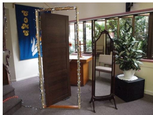
Décor in the Sanctuary area