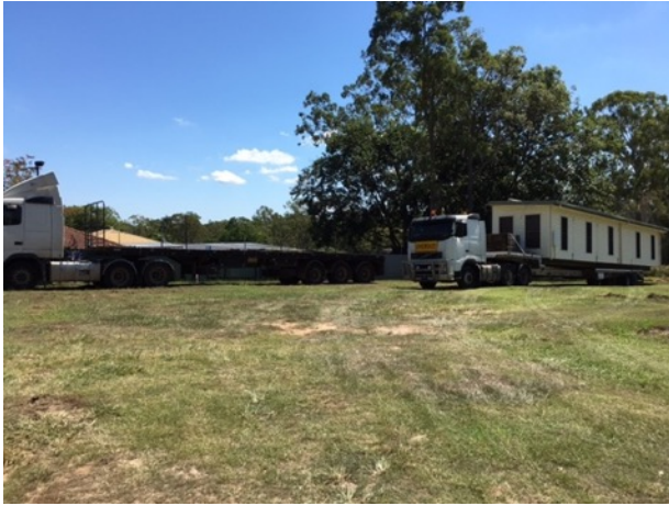
Left - The first demountable arrives – 3 rd April